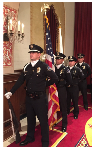
(Right) The Burbank Police Honor Guard prepares to present the nation's colors.