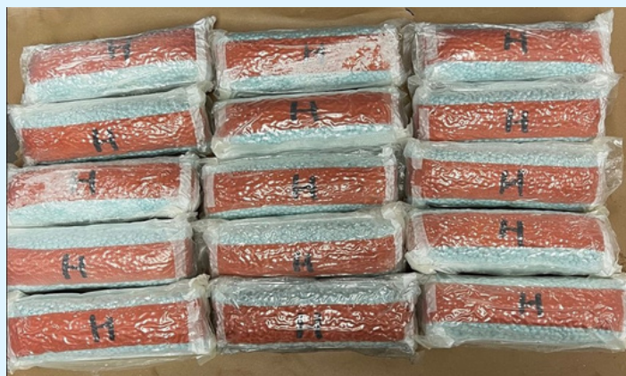
100,000 fake oxycodone pills seized in July of 2022 in Burbank

Please remember the only safe medications are ones that come from licensed and accredited medical professionals. The Burbank Police Department reminds the community that pills purchased outside of a licensed pharmacy are illegal, dangerous, and potentially deadly.