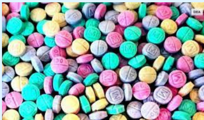
Fake pills colored to resemble candy